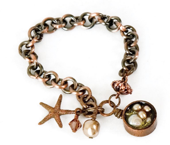
Enchantment Under the Sea - Bracelet by Sondra Barrington