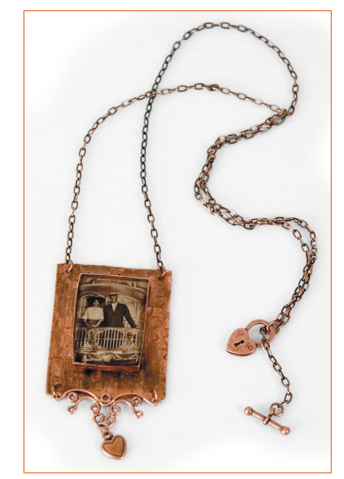
Only a Postcard - Necklace by Amy Mickelson